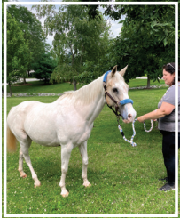
Faith... a Palomino Paint

These are the latest anxiously awaiting the starting of camp season. The horses have as much fun as the youth; they enjoy friends and companions. We thank the Lord for sharing part of His wonderful creation. Shown here are: