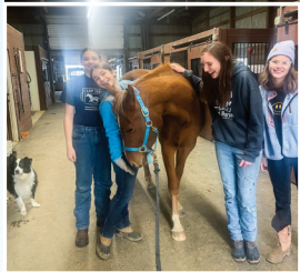
Harley... a Heinz 57