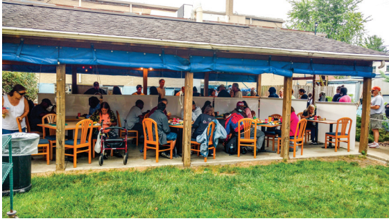
table umbrellas so the Lord blessed. It was a great menu prepared by our chefs: BBQ Ribs, Broasted Chicken Breast, Grilled Brats and Super Thick Cheese Burgers along with all of the other fixins'.

We often think of how many lives the mission has had a part in directing to Christ and await in Heaven for a great reunion.