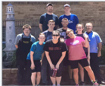
Jeffersonville Missionary Baptist Church - Coal Grove, OH

Thanks again for your service unto the Lord!