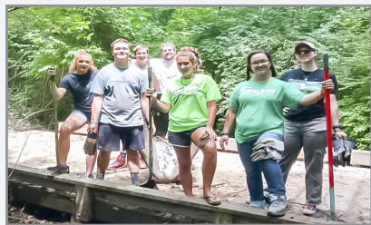
New Hope Christian Church - Bridgeport, IL