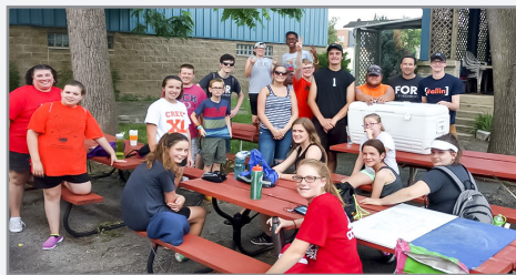
Faircreek Church Youth - Beavercreek