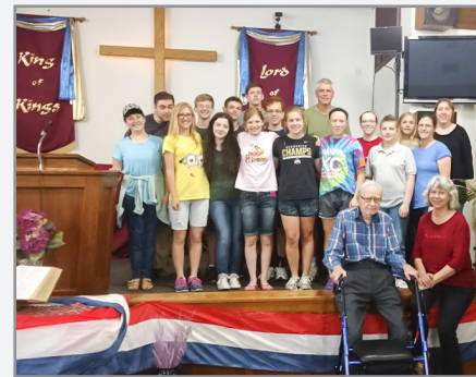
Sovereign Grace Church - Bellbrook